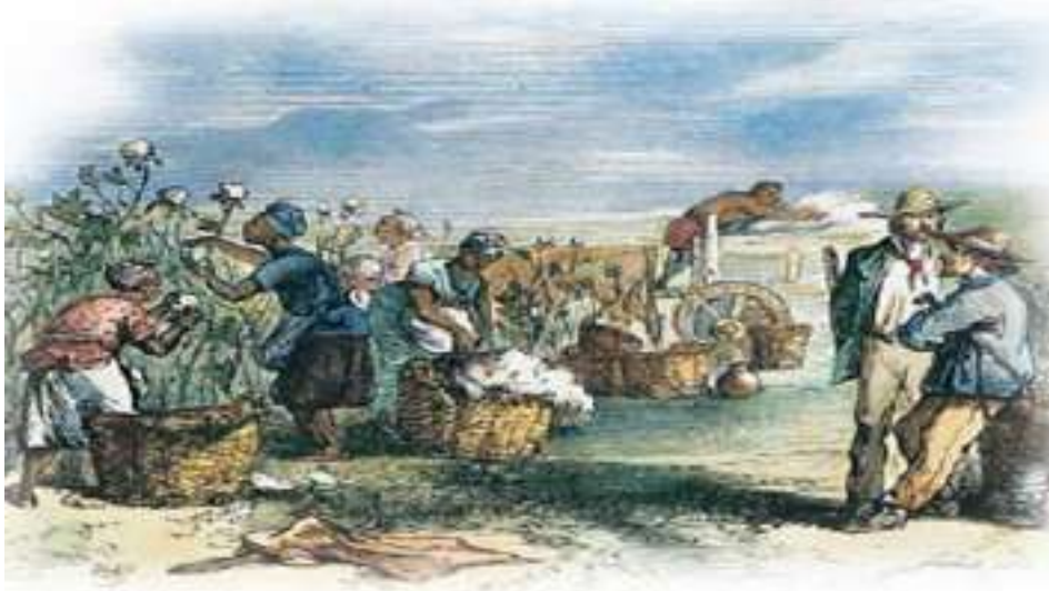
Enslaved workers labor in the cotton fields.